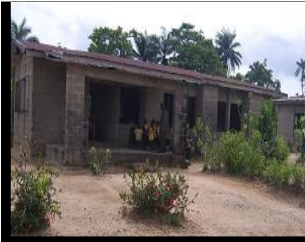
Temporary Classroom Building