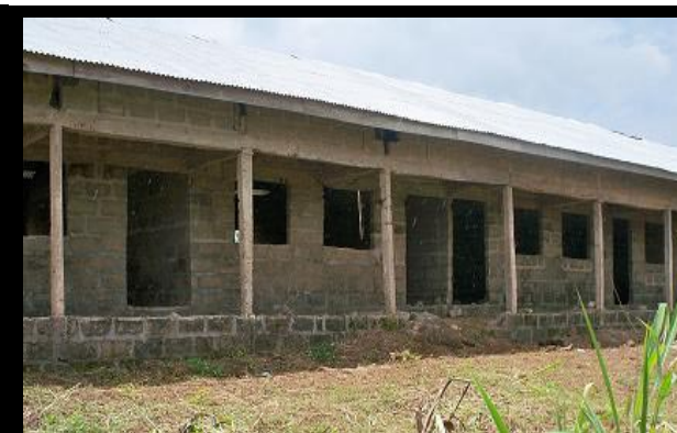
New Building Front Elevation View