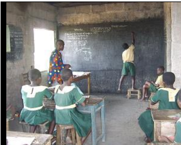
Classroom B view