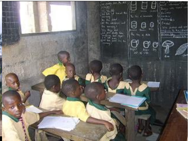
Classroom A View