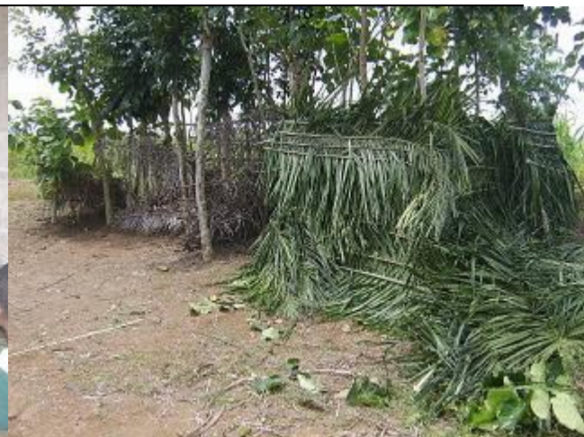
Makeshift School Toilet