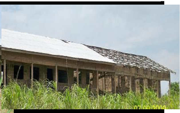
New Building Roof Top View